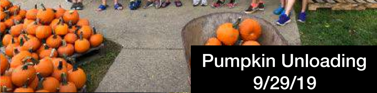
Pumpkin Unloading 9/29/19