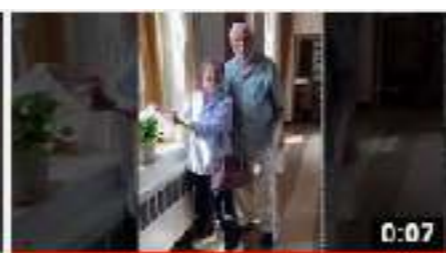
June 11, 2020 - FUMC Daily Update