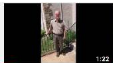
June 1, 2020 - FUMC Daily