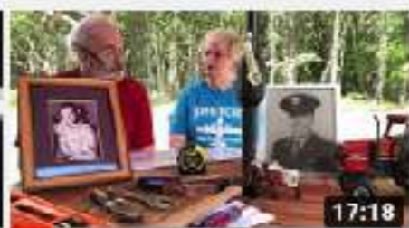
June 21, 2020 - Virtual Worship Service