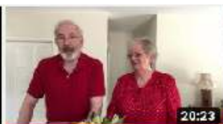
May 31, 2020 - Pentecost