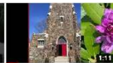
June 4, 2020 - FUMC Daily Update