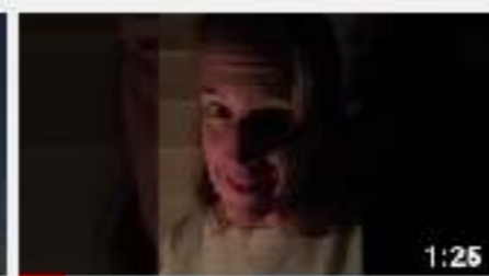
June 18, 2020 - FUMC Daily Update