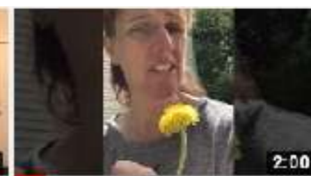
June 6, 2020 - FUMC Daily Update