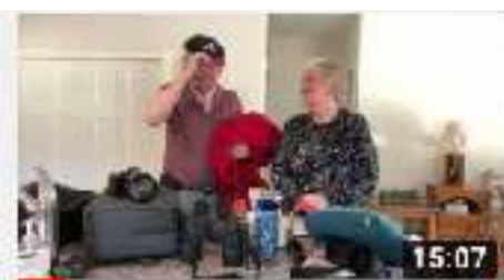
June 14, 2020 - FUMC Virtual Worship Service