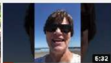
June 19, 2020 - FUMC Daily Update