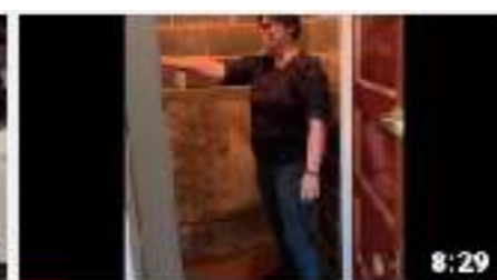
May 27, 2020 - FUMC Daily