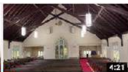
May 29, 2020 - FUMC Daily