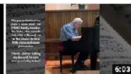
May 26, 2020 - FUMC Daily