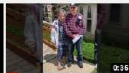
June 17, 2020 - FUMC Daily Update