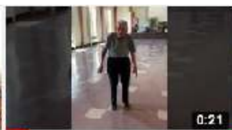
June 12, 2020 - FUMC Daily Update