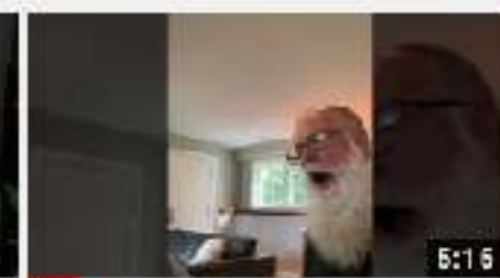
June 15, 2020 - FUMC Daily Update