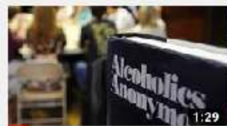
June 25, 2020 - FUMC Daily Update

Thank you to everyone who has been and will be part of the Daily Updates being sent out via email, Facebook and YouTube. We are a family, a community of believers who know that with God's grace we will get through these challenging times together.