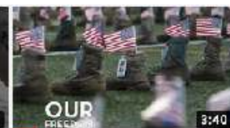
May 25, 2020 - Memorial Day