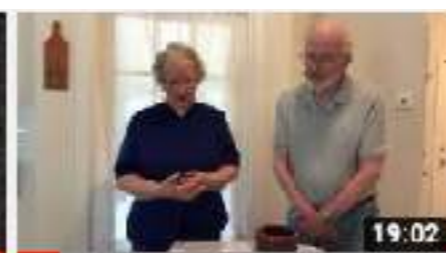
June 7, 2020 - FUMC Virtual Worship Service